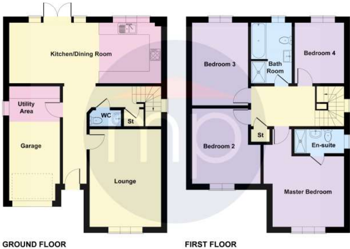
Not to Scale. Produced by The Plan Portal 2023 For Illustrative Purposes Only.

The information provided about this property does not constitute or form part of an offer or contract, nor may it be regarded as representations. All interested parties must verify accuracy and your solicitor must verify tenure and lease information, fixtures and fittings and, where the property has been recently constructed, extended or converted, that planning/building regulation consents are in place. All dimensions are approximate and quoted for guidance only, as are floor plans which are not to scale, and their accuracy cannot be confirmed. Reference to appliances and/or services does not imply that they are necessarily in working order or fit for the purpose. We offer our clients an optional conveyancing service, through panel conveyancing firms, via MWU and we receive on average a referral fee of one hundred and thirty pounds, only on completion of the sale. If you do use this service, the referral fee is included within the amount that you will be quoted by our suppliers. All quotes will also provide details of referral fees payable.